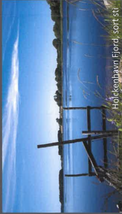
Hoickenhavn Fjord, sort sti