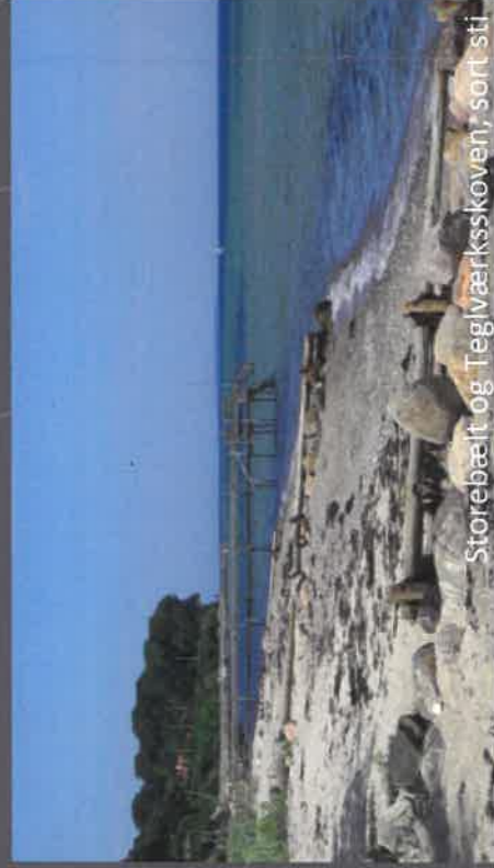
Storbælt og Teglværksskoven, sort sti